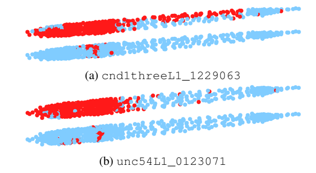
Figure 1: Visualization of the maximal ILP subproblem for worms, where dots correspond to cell nuclei. Red dots are part of the ILP subproblem ( \bullet \in \mathcal{V}_{\mathcal{B}} ) and for blue dots the solution of the LP-relaxation is used ( \bullet \in \mathcal{V}_A ). For both instances, the upper image shows the result for clp and the lower one corresponds to dclp, see the experimental evaluation section for information about the solvers.

As can be seen from comparing Proposition 1 and Theorem 1, the main difference between the methods is that we use a partition of the graph \mathcal{G} , i. e. non-intersecting subgraphs, whereas the subgraphs in CombiLP are boundary complement and therefore intersect.